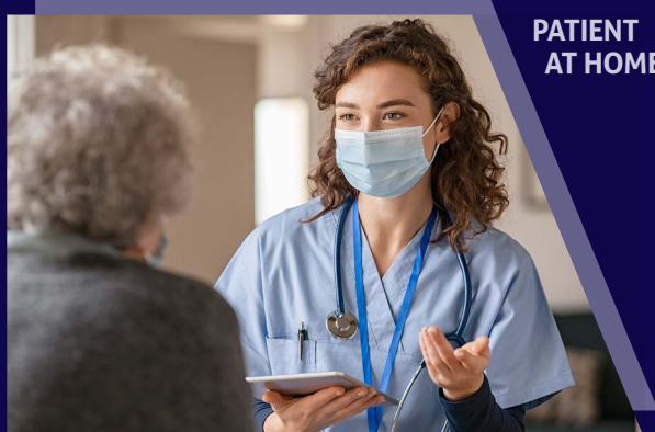
PATIENT AT HOME