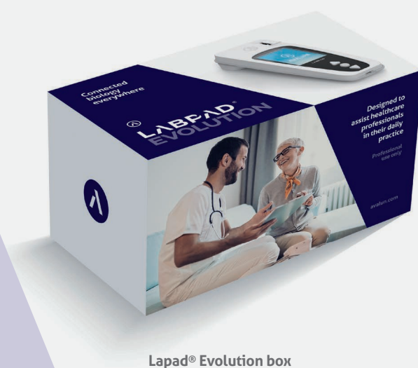
Lapad® Evolution box